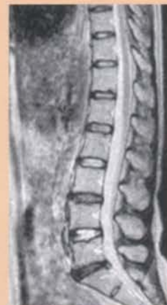
Fig. 2: Lumbar MRI from an individual with genetic predisposition

mechanisms of bone and cartilage formation, maintenance and disease. One example would be the genetic predisposition and mechanisms of intervertebral disc degeneration (Fig 2). Through this understanding, innovative treatment strategies to treat musculoskeletal disorders can be identified. This may include treatment by gene therapy, cell therapy and tissue engineering. This would benefit individuals suffering from many musculoskeletal disorders, and put Hong Kong at the forefront of skeletal research worldwide.