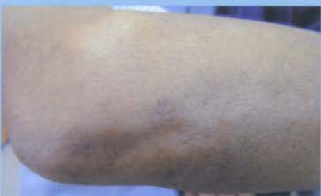
Fig.8 Minimal scars left after arthroscopic olecranon bursectomy.