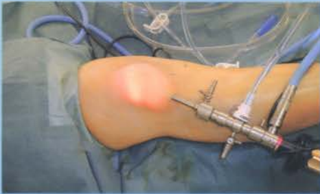
Fig.6 Arthroscopy in right pre-patellar bursa, preparing for bursectomy.

Inflammation of bursa can occur due to mechanical irritation directly in the region of bony prominence or it can arise spontaneously. Common sites are over olecranon and patella. Arthroscopic bursectomy can be performed with mild post-operative pain and minimal surgical scar. (Fig. 6, 7 & 8)