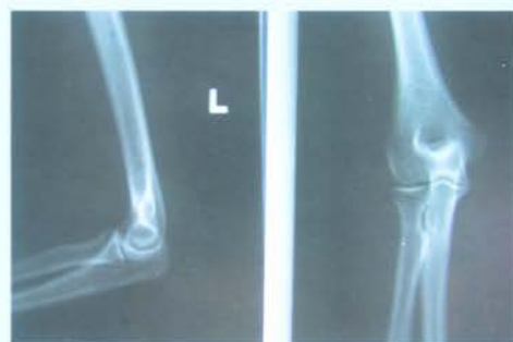
Fig.3 X-Ray of early RA elbow. Synovectomy has favourable long term result.