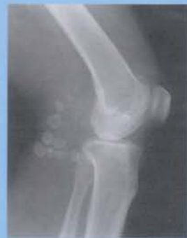
Fig.13 X-Ray showing multiple ossified loose bodies in synovial osteochondromatosis of knee.