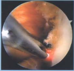
Fig.5 Laser treatment in haemorrhagic synovitis.

Haemorrhagic synovitis occurs due to repeated haemarthrosis in haemophilic patients. Arthroscopic synovectomy can provide pain relief and reduce the incidence of haemarthrosis in early stage of haemophilic arthropathy (Fig. 5).