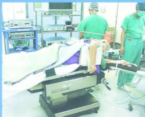
Fig.1 One possible positioning for patient going for elbow synovectomy.

shoulder. Studies showed that arthroscopic synovectomy for rheumatoid elbow can reliably alleviate pain, but only patients with mild radiographic changes had favorable results with regard to total function in long term. However, extensive joint involvement is not an absolute contra-indication because even in patients with advanced disease, synovectomy may result in acceptable pain relief and sometimes even increased range of motion. (Fig. 1, 2, 3 & 4)