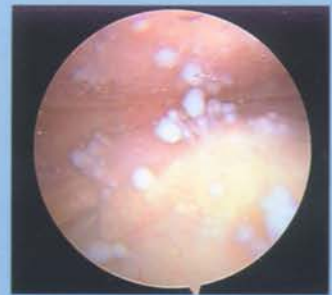
Fig.12 Arthroscopic view of synovium in synovial osteochondromatosis.

Synovial osteochondromatosis is intrasynovial proliferation of lobules of cartilage with occasional ossified areas occurs within layers of the membrane. X-ray may show multiple loose bodies. Treatment consists of removal of loose bodies and synovectomy (Fig. 12 & 13)