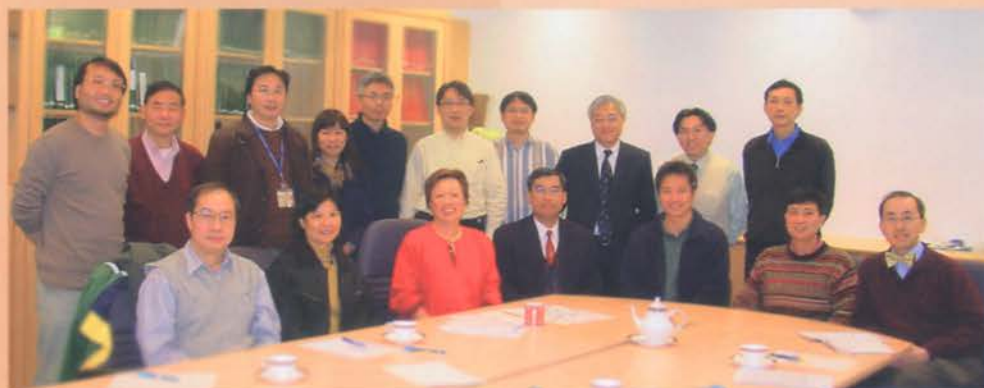
Fig. 1: Members of the AoE team.

As part of this programme we are trying to identify genetic factors that predispose individuals to intervertebral disc degeneration. We need volunteers between the ages of 18 and 50 who are willing to undertake an MRI examination of the lumbar spine and provide a blood sample for DNA analyses. In return they will be given a free examination of their back. Interested individuals please contact Ms Yu by fax [28174392] or e-mail [yupei@hkucc.hku.hk], providing your name and contact details.