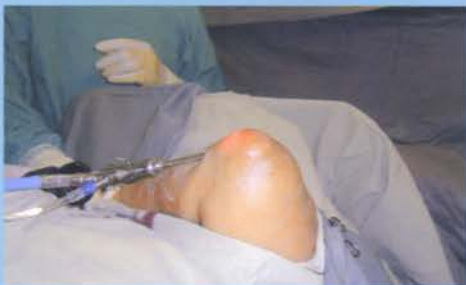
Fig.7 Arthroscopy in left olecranon bursa, preparing for bursectomy.