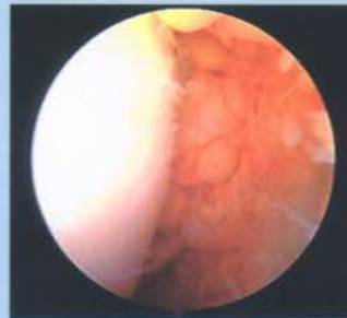
Fig.9 Arthroscopic views of PVNS.

Lipoma arborescens is a rare intra-articular lesion characterized by villous proliferation of synovium and hyperplasia of subsynovial fat. MRI shows characteristic T1-weighted hyperintense fat signals within the synovial proliferations. (Fig. 10 & 11)