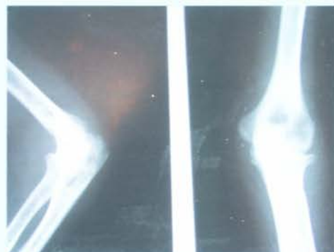
Fig.4 X-Ray of more advanced RA elbow. Synovectomy may result in pain relief.