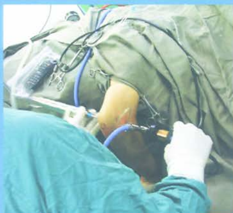
Fig.2 Surgeon performing right elbow arthroscopic synovectomy in a RA patient.