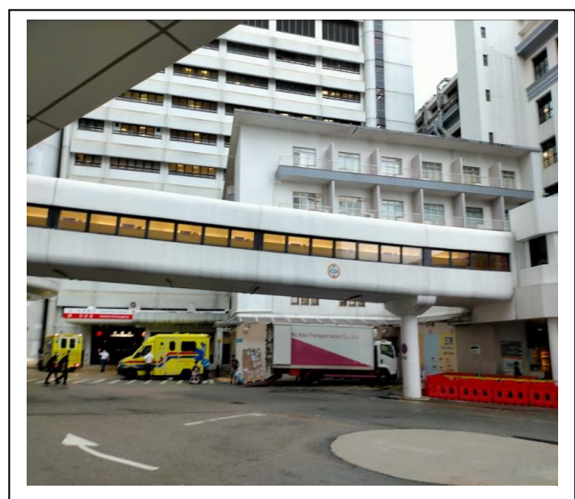
Queen Mary Hospital