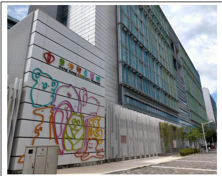
Hong Kong Children's Hospital