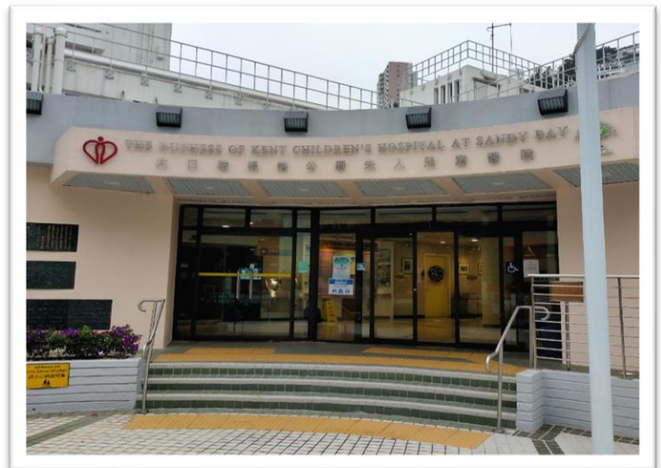
Duchess of Kent Children's Hospital