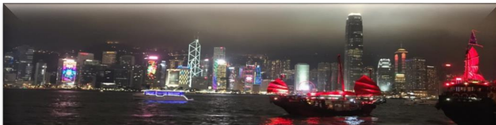
The Victoria Harbour