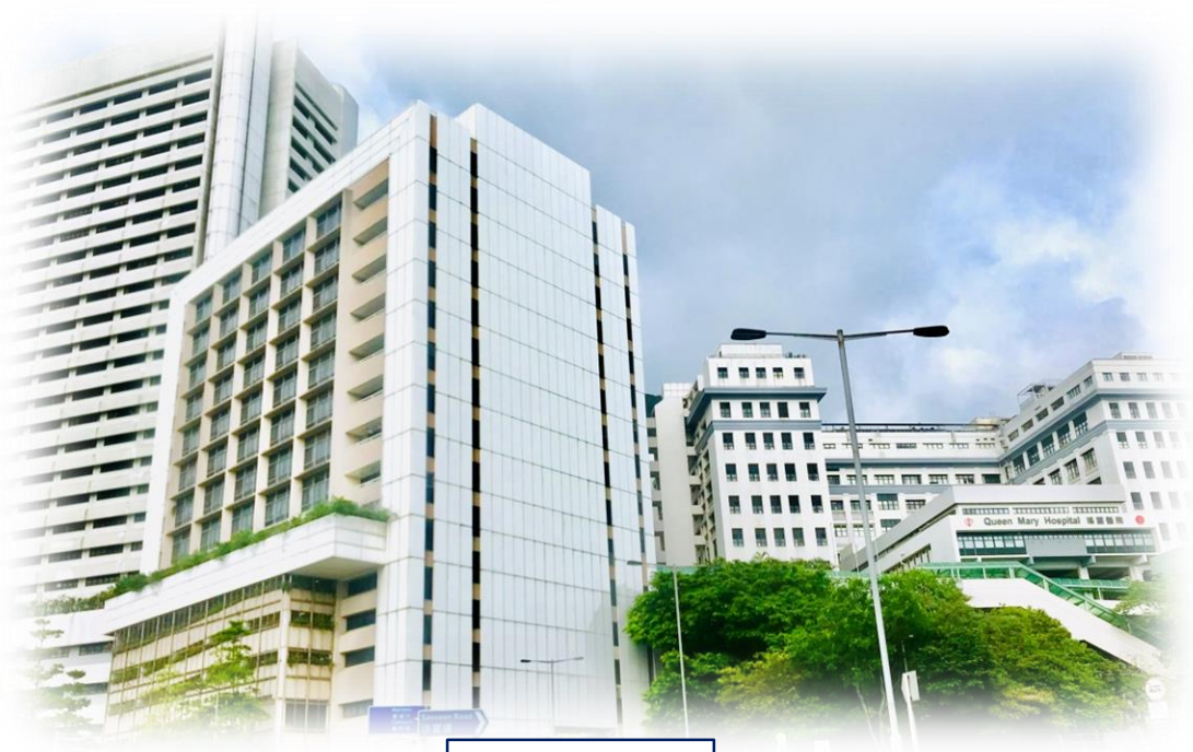
Queen Mary Hospital