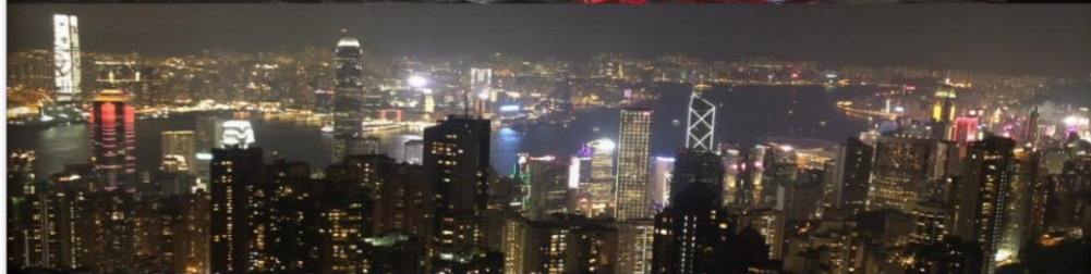
The Victoria Peak