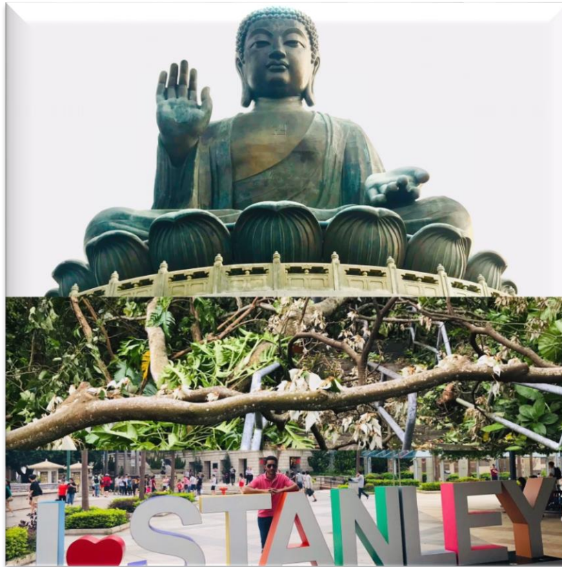
The Great Buddha