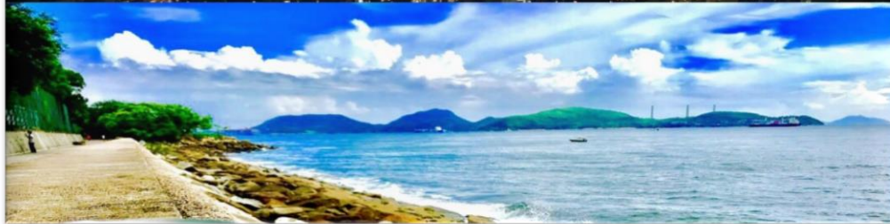
The Sandy Bay