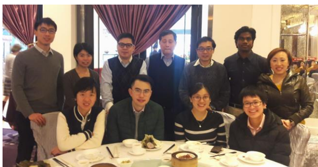
wih Department of Oncology & General Orthopaedics.